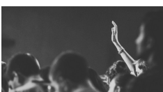
Worcester School Committee Forum: Putting All Children First

Once again, WEC will co-host a forum for School Committee candidates this fall