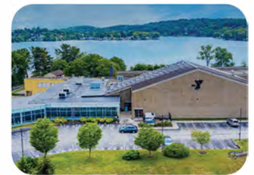
Greendale Family Branch