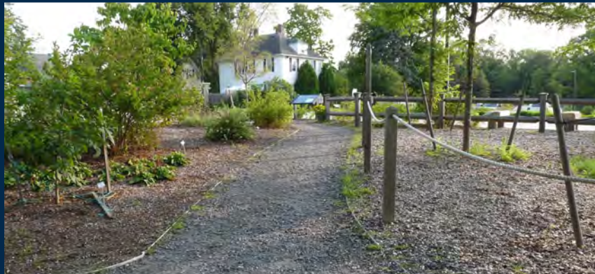
All Persons Sensory Trail