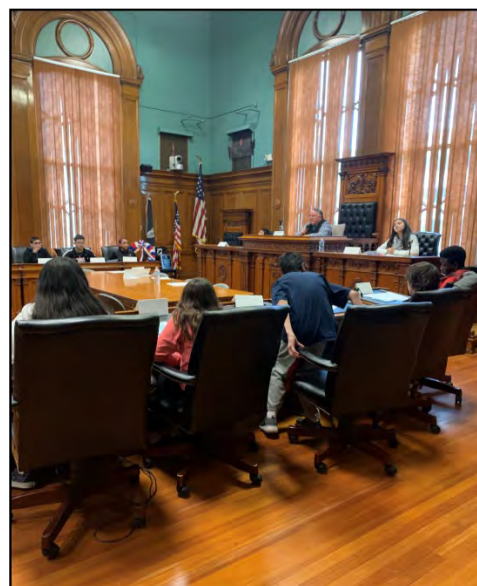
Mock City Council Meeting