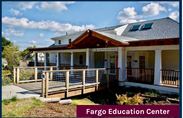
Fargo Education Center