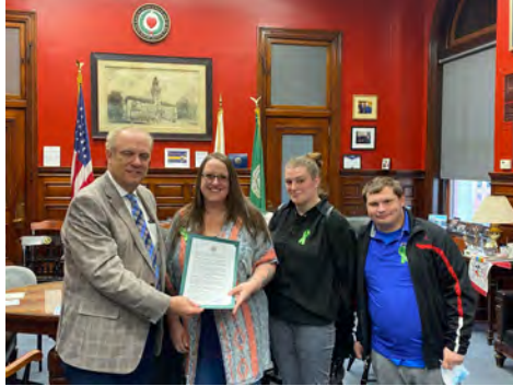
PPAL + YMM Youth Advocates accept 2022 Children's Mental Health Week Proclamation from Worcester Mayor Joseph Petty

Central MA Office 21 Cedar Street, Floor 1 Worcester MA, 01608 Tel: (508) 767-9725 Fax: (508) 767-9727