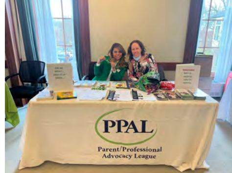
PPAL table at a community event