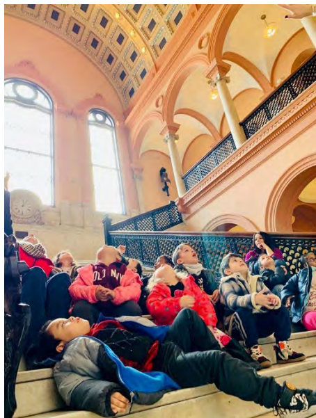
Head Start tour of City Hall

Areas WPS teacher want curriculum outreach/supporting material.