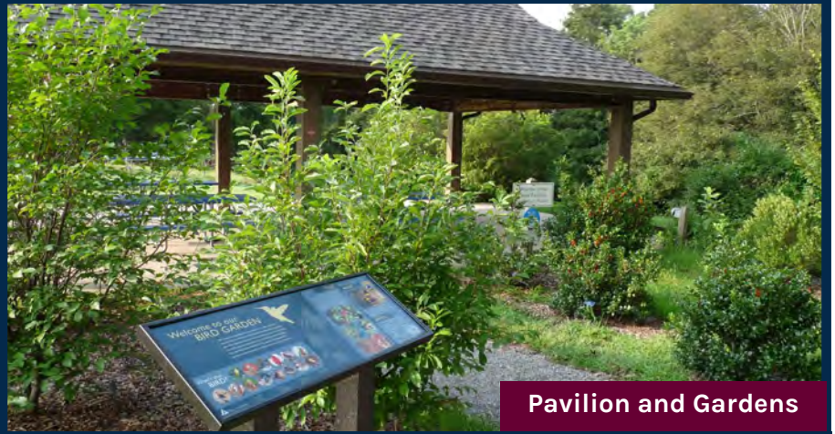
Pavilion and Gardens