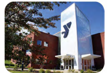
Central Community Branch