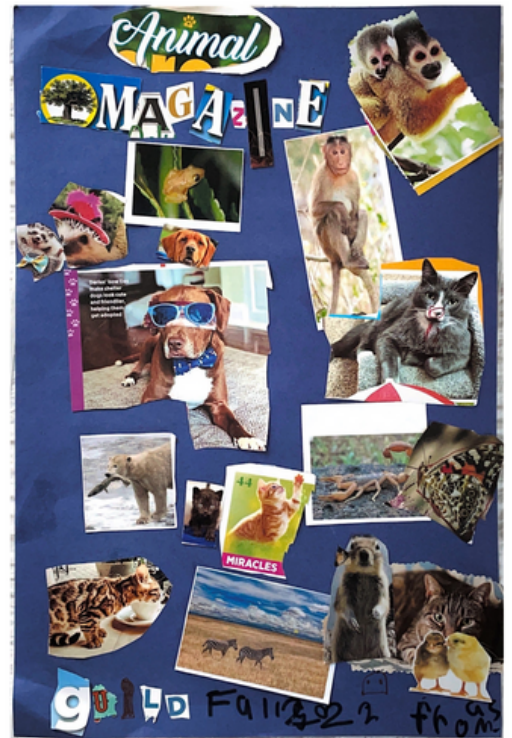
Above: Guild of St. Agnes students created an Animal Magazine after researching their favorite creatures.

Programs are also providing ever-better learning opportunities, as indicated through significant improvement on third-party observations in metrics such as program organization, structure, and the social emotional environment.